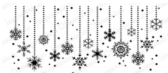
Snowflake Dangles, F14562, from Impression Obsession; measures approximately 4.25" x 2.25"

As a bonus to you, for the months of January, February and March, you can receive 15% off any of the stamped images seen in this newsletter (while supplies last). If you are unable to visit us, we’ll happily mail them to you. Call 812-988-7009 or email us at wishful.thinking@att.net .