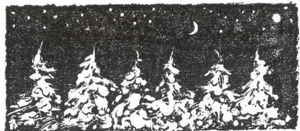
Snowscape, #3726K, from Penny Black, measures approximately 4.25" x 2"

If, however, if Punxsutawney Phil does not see his shadow, meaning spring will arrive early, all spring-themed stamps, papers and embellishments will be 30% off!