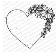
Heart Cascade, #C12118, from Impression Obsession, measures approximately 3" x 2.75"

cling sets from over 30 stamp companies! We've got you covered for every occasion, holiday, and season!