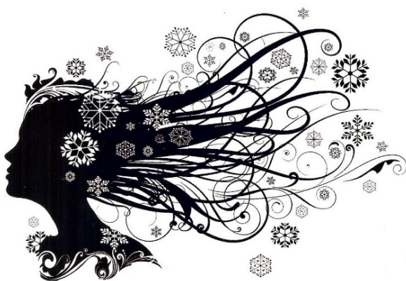
Rebecca Snow Queen, #58-788-000R, from Indigo Blue, measures approximately 5.5" x 4"

Oh, boy! We hope you'll join us in us a fabulous year of crafting at Wishful Thinking!