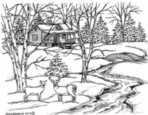
Cabin, Trees, Deer and Stream, #P10548 from Northwoods, measures approximately 4.5" x 3.5"