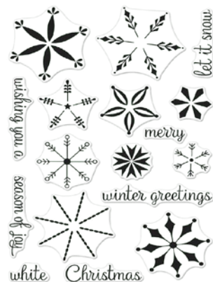
Stacking Snowflakes, #CM308, from Hero Arts. This is a clear set of stamps. The large snowflake in upper left measures approximately 1.5" x 1.5"

At the beginning of January we count everything in the shop, do some deeper cleaning and even do some re-arranging. It's exhausting, but it's fun! And, lucky you, this is the time of year you'll find more goodies in the Sale Areas as we make room for all the new Valentine's, Spring and Easter products! While you're here rummaging through those Sale items, you're sure to find something new as well – here's a peek at what you'll find: