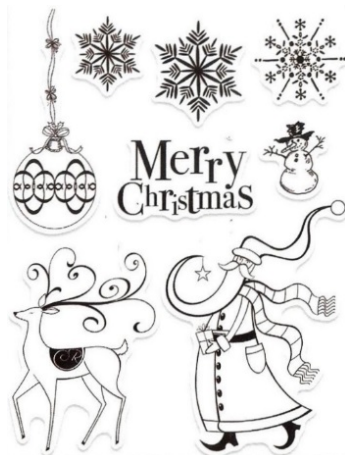
North Pole Treasures (clear set) #30-437, from Penny Black; Santa measures approximately 2.5" x 3.5"

We appreciate all of you for your support and friendship, so we're going to treat you to a HUGEMONGOUS SALE from December 22 - 30! Watch your emails, our website and our Facebook page; we'll have more details as we get closer to the date!