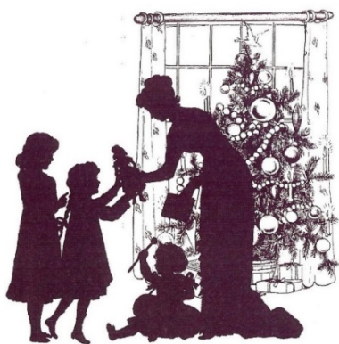
Christmas Morning Silhouette, #L13586, from Impression Obsession, measures approximately 4" x 3.75"