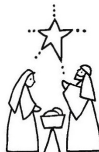
Tiny Nativity, #E287, from Stampendous, measures approximately 1.25" x 1.75"

in this newsletter (while supplies last). If you are unable to visit us, we'll happily mail them to you. Call 812-988-7009 or email us at wishful.thinking@att.net .