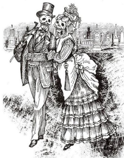
Strolling Skeletons, #CRR293, from Stampendous, measures approximately 3.75" x 4.75"

early to start packing up your gently used and no-longer wanted craft supplies for next year's sale.