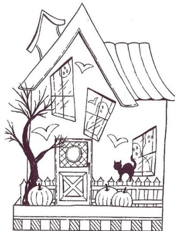
Halloween House, #H16326, from Impression Obsession, measures approximately 2.75" x 4"

Wishful Thinking Monthly Card Classes! Plan on gathering at the shop on the 2 nd Tuesday of the month for some serious play time and card making! Join us from 1:30 to 3:30 to learn new techniques, create beautiful cards, and meet other stamping enthusiasts! How fun is that? Please call in advance to reserve your seat, 812-988-7009.