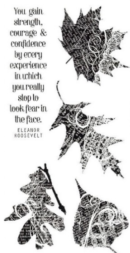
Collage Leaves (clear set), #WP769, from Impression Obsession; verbiage stamp measures approximately 1.25" x 4"