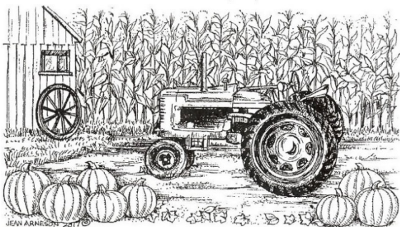
Tractor, Cornstalks & Shed, #NN10302, from Northwoods measures approximately 4.5" x 2.5"

Make sure you take some time to visit Brown County State Park sometime in October for some jaw-dropping autumn scenery. We don't want you to miss out on any of the fun, so check out the visitor center's website to see a full calendar of events, www.browncounty.com .