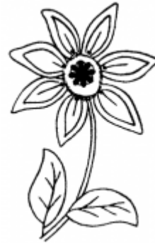
7 Petal Posey, #K5-2735, from Stamper's Anonymous, measures approximately 1.75" x 2.5"

Wishful Thinking Monthly Card Classes! Plan on gathering at the shop on the 2 nd Tuesday of the month for some serious play time and card making! Join us from 1:30 to 3:30 to learn new techniques, create beautiful cards, and meet other stamping enthusiasts! How fun is that? Please call in advance to reserve your seat, 812-988-7009.