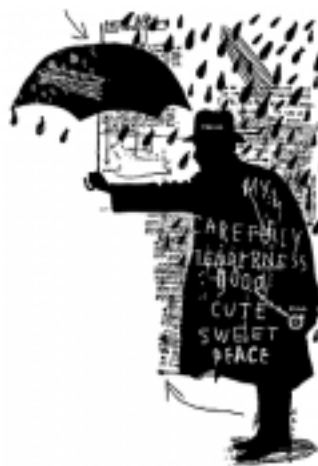
Tenderness, #P4-2843, from Stamper's Anonymous, measures approximately 2.75" x 4"

As a bonus to you, for the months of July, August and September you can receive 15% off any of the stamped images seen in this newsletter (while supplies last). If you are unable to visit us, we'll happily mail them to you. Call 812-988-7009 or email us at wishful.thinking@att.net .