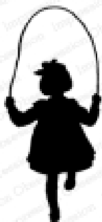
Jump Rope Silhouette, #E13527, from Impression Obsession, measures approximately 1.5" x 3.5"

Read on so you don't miss out on all our upcoming fun classes and events!