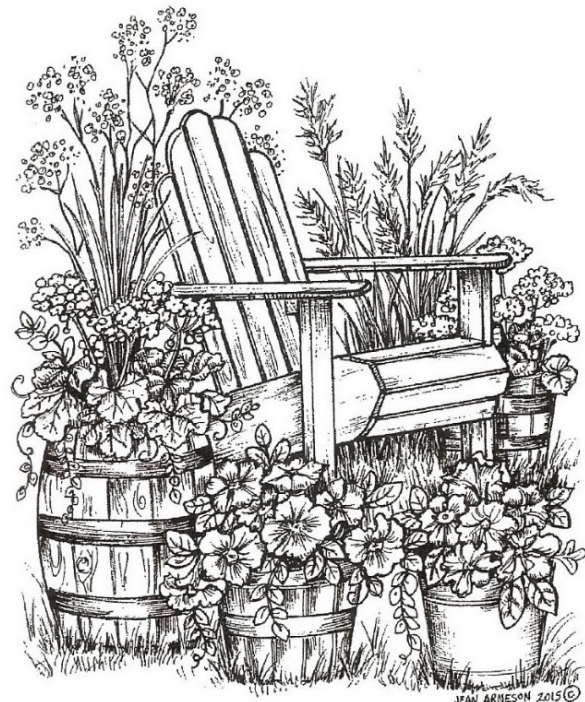
Adirondack Chair & Floral Pots, #P9772, from Northwoods, measures approximately 2.5" x 4.5"

** Note: Because of our Used Stamp & Craft Sale, we will not have a class on July 19. **