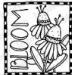
Bloom, #C19085, from Impression Obsession, measures approximately 1.75" x 1.75"

New Stuff at Wishful Thinking! My goodness, can we fit all the new, awesome products on the market in our little shop? We certainly can...well, ok, we're trying! Here's some of the fun stuff you'll find: